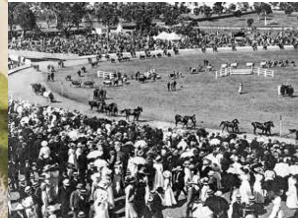
Claremont Showground — Grand Parade, c1905

The school precedes electricity in homes. A power station in Claremont didn't come until 1905.