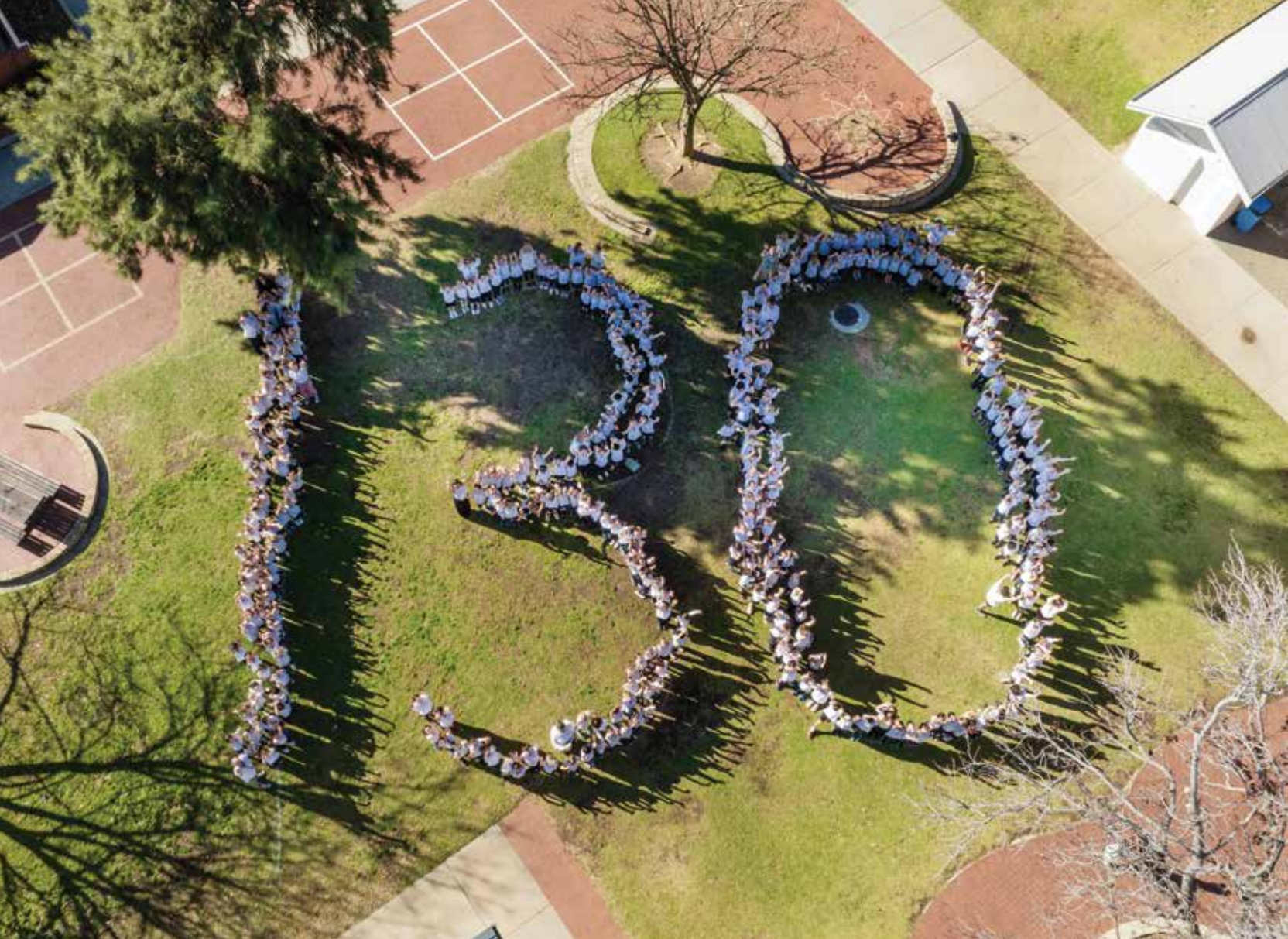
Freshwater Bay Primary students celebrating the schools 130 year anniversary.