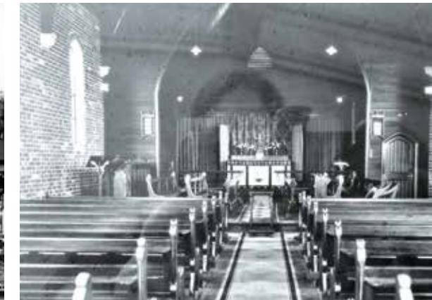
Church of Resurrection — Chapel at St Oswalds

The clubhouse will be redeveloped to make way for an updated building at this historic location.