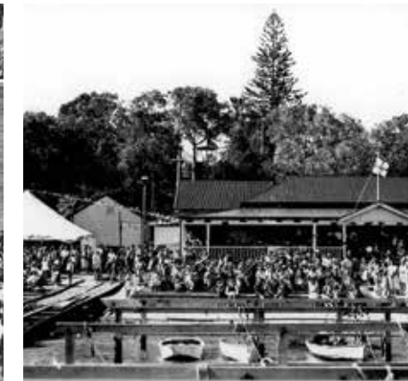
Claremont Yacht Club Opening Day, 1949

The State Government along with the Royal Agricultural Society are working towards an improvement plan for the historic space and redevelopment of the site making way for an improved facility.