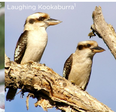
Laughing Kookaburra 1

The key differences between earlier, first generation anticoagulant rodenticides (FGARs) and SGARs is how long the toxins remain in the body. FGARs break down quicker, and so there is less chance of larger animals being poisoned. SGARs can stay in body tissues for months or even years. Yet Australia has little regulation on their use - SGARs can be easily purchased in hardware and grocery stores across the country.