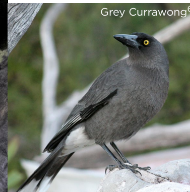
Grey Currawong 6