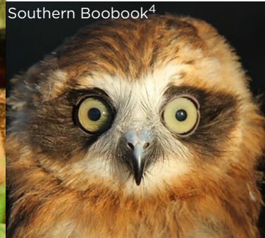
Southern Boobook 4

Even at less-than-lethal levels, toxins still make birds clumsy and slower to respond to threats - making them less efficient hunters, and more likely to be hit by cars.