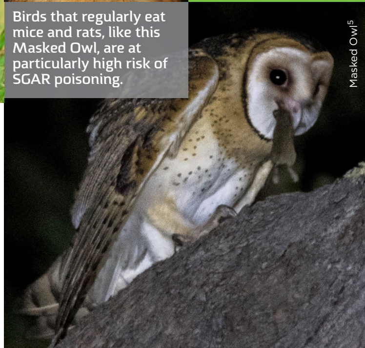
Masked Owl 5

Birds that regularly eat mice and rats, like this Masked Owl, are at particularly high risk of SGAR poisoning.