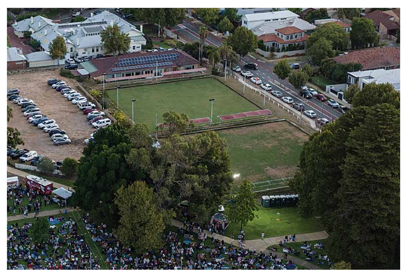
Aeirial view of the upcoming community centre