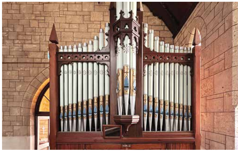
The first pipe organ built in Western Australia, completed by R. C. Clifton in 1879 and still in use today.