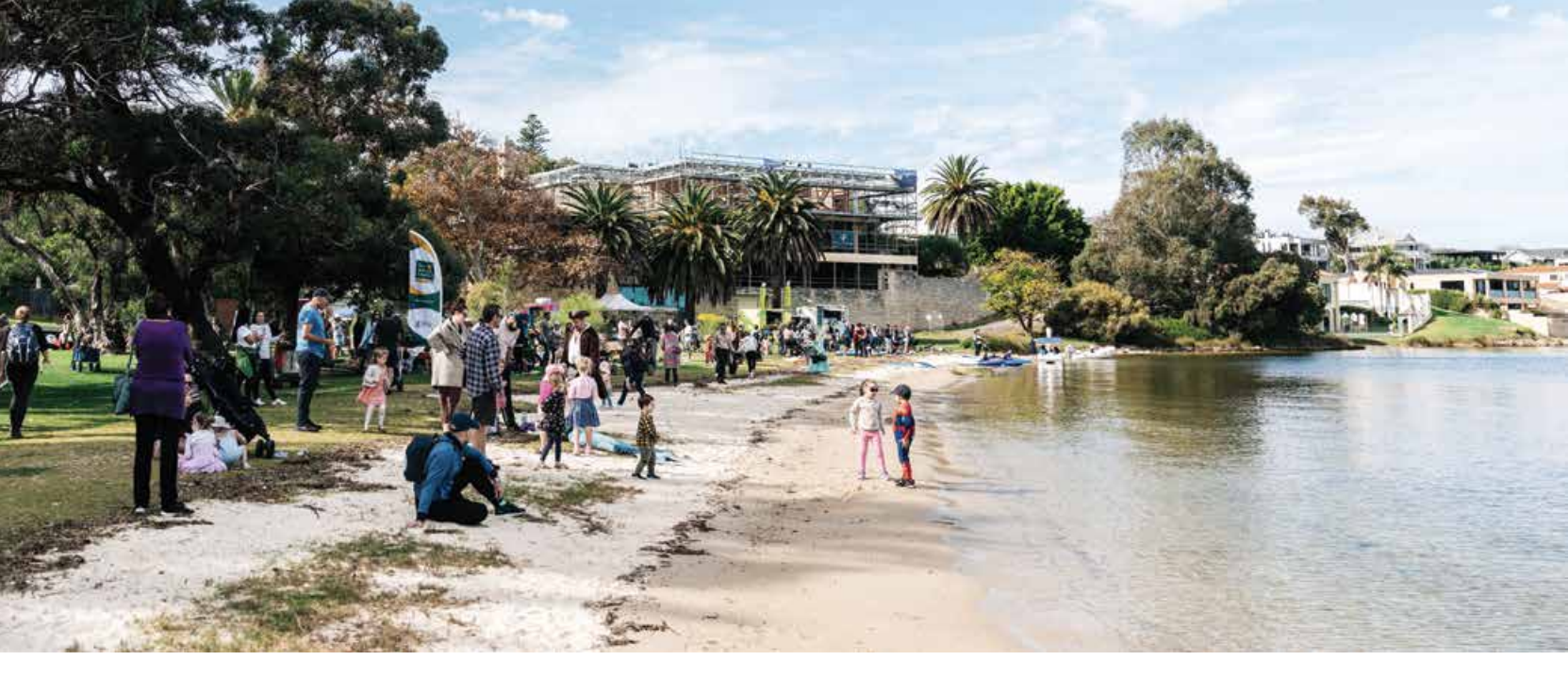
Freshwater Bay foreshore