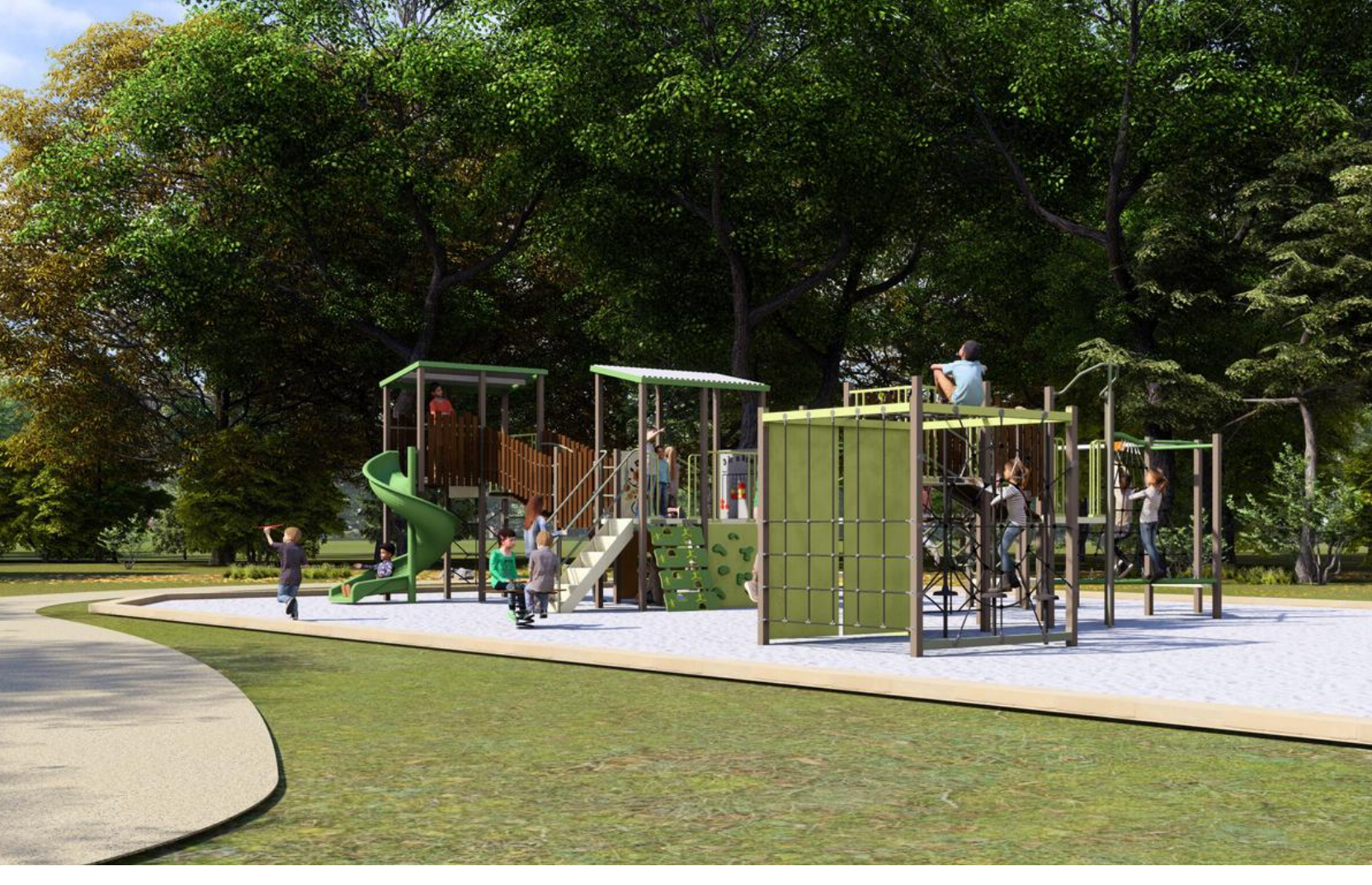
Active Discovery playground concept