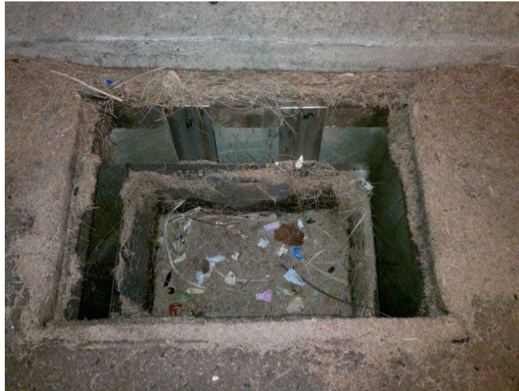
Figure 5: Stormwater drain insert to collect sediment

In some instances, a sediment control fence may be difficult to install due to the location of stormwater drains requiring protection. In such cases, a stormwater drain insert can be installed in a gully entry drain to perform a similar function to a sediment control fence (Figure 5).