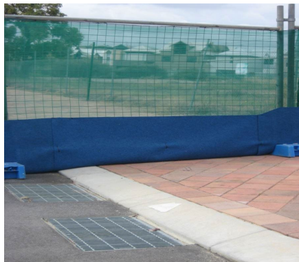
Figure 2: Front view showing sediment control fence protecting stormwater drains.

The sediment control fence enables water to pass through, but traps sand and other coarse material before it washes into the stormwater drainage system (Figure 2).