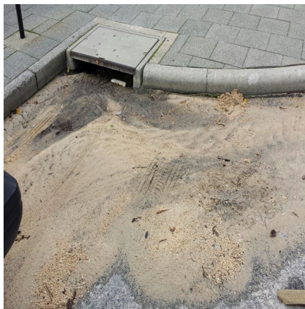
Figure 1: Build-up of sand washing into side-entry drain

Aside from environmental factors, sand drift from development sites can also result in dust, causing a nuisance to neighbouring properties. The costs associated with remediation of the impacts of sediment drift can be considerable.