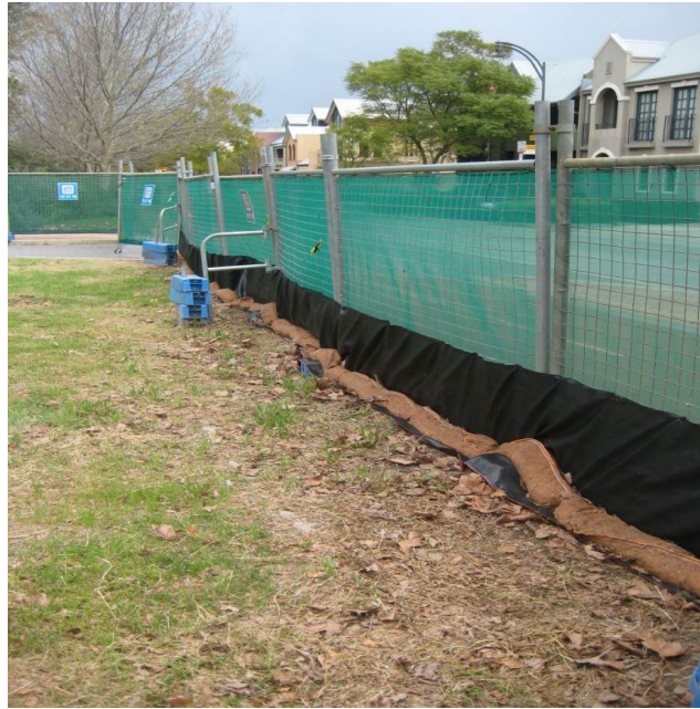
Figure 3: Side view showing fence with geotextile fabric secured to the ground.

The height of the geotextile material, after the lower edge is properly sealed and secured, should be a minimum of 600 mm for residential blocks. For large construction sites or if dust is also likely to be a problem, then the sediment control fence may need to be higher.