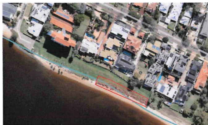
Foreshore Planting Locations