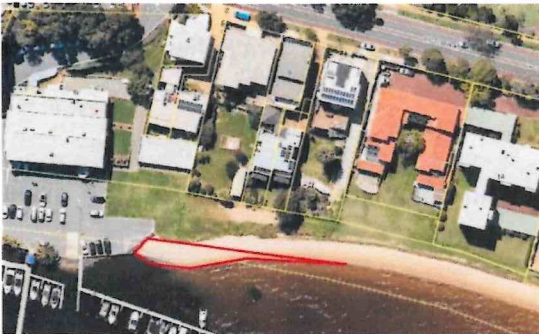
Sand to be removed from East of Claremont Yacht Club.