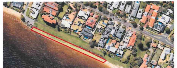
Sand to be relocated to the East of Chester Road car park.